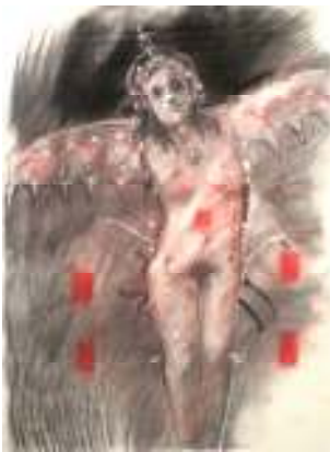
Untitled, 1998 Pastel and mixed media on paper 30” x 22”