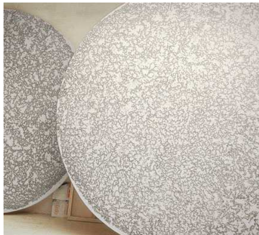
Studio view of at left, For Jagannatha 1 , 2003, Oil on canvas, 126" diameter; at right, For Jagannatha 3 , 2004, Oil on canvas, 126" diameter.

In For Jagannatha (2003-2006), a grouping of four, oil on canvas paintings on view, tiny dark branch-like natural forms emanate outward from the center of each painting and collect at the edges to form intricate constellations. Patterns created by these massing forms take on elastic dimensions as figure and ground shift constantly. Yet, while apparently following the conventions of gestural painting, Long challenges its established languages and questions its assumptions.