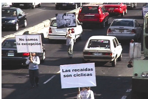
Traffic, curatorial action, 2004 Video still

The Mexico City-based collective, Laboratorio 060, blurs the line between the processes of curating and art making through elements of art history, humor and contemporary social commentary. Since coming together in 2003 as part of a seminar on curatorial practice in Mexico City, Laboratorio 060 has brought their varied projects to traditionally peripheral audiences through inclusion, not just presentation, “creating new communities within the relational sphere of art.” Underlining the participatory and sometimes