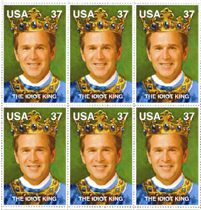
Idiot King [detail], 2001 Sheet of perforated, laser printed stamps 8 1/2" x 11"

Mixing political commentary with artistic innovation, Houston-based artist, David Krueger’s work broadcasts a message of disappointment and political disillusionment through the humble postage stamp. Derived from childhood memories of a Texas Post Office and stamps that memorialize the great accomplishments and characters of American history, Krueger strives to commemorate instances of greed, corruption and cruelty evident in contemporary America.