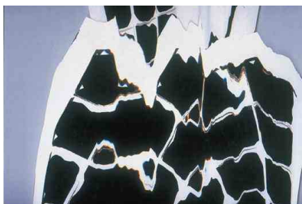
Untitled, 2006 Acrylic over digital print on canvas. 13” x 19”.

During the last ten years Goldberg has continued her experimentations with form through a variety of media and selections of her black and white and color print photography, sculpture, video and collage will be on view. Most recently, she has been digitally transposing quiet shapes culled from earlier paintings into pulsating and highly evocative, acrylic-over-digital-print compositions.