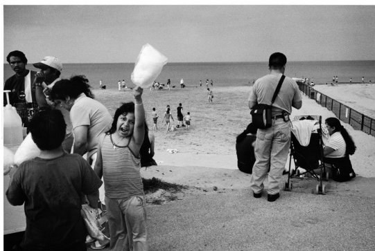
Untitled from the series ONLY Chicago , 2004 Gelatin silver print, 16” x 20”, Edition of 10.

The everyday interaction of people with their surroundings continues to fascinate Elderfield and presents him with endless opportunities to capture unique moments of joy in the simple, the random, and the obscure. Stopping time with his camera, he frames the nuances that distinguish the urban existence from an insider’s perspective in order to make the inconsequential monumental.