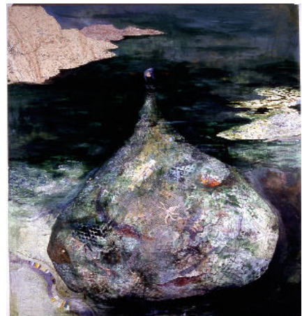
Night Fishing, for Nelly, 2004 Ink, acrylic, on antique maps on panel 50” x 48”

In Night Fishing, for Nelly, 2004 , for example, the viewer is immersed in a dark green watery world where the landscape is virtually eliminated. Map fragments are built up from the surface to form a net which teems with otherworldly creatures, both forbidding and inviting.