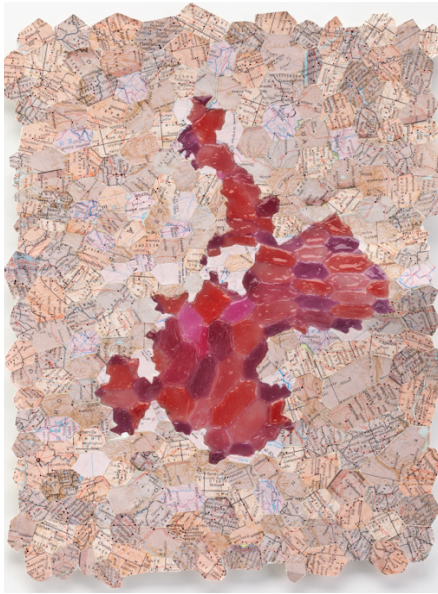
Hazel , 2010 Collaged map, acrylic medium, 12 3/4" x 10"