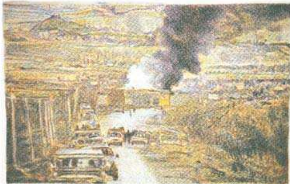
Checkpoint, 2003 Crayon rubbing on parchment, 15" x 20.5"