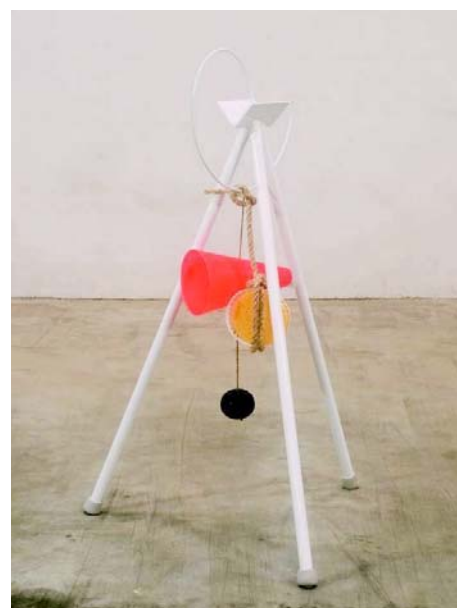
I wish you could come home with me tonight, 2009 Metal, plastic, wood, rope and paint 23” x 39”

On view at CUE Art Foundation, Ansathammarat’s first solo show in New York, will be a collection of large to medium-scale paintings and medium to small-scale floor-standing assemblages, all created during the artist’s temporary return to Thailand in 2009. Through the incorporation of all planes within the gallery space, the artist effectively creates a formal and conceptual “diary” – one in which we all share at least one entry.