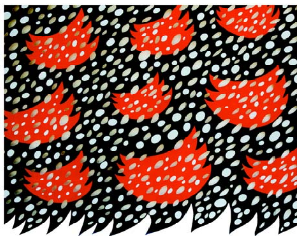
She left me for L.A. [detail], 2009 Acrylic on cut canvas 120” x 240”